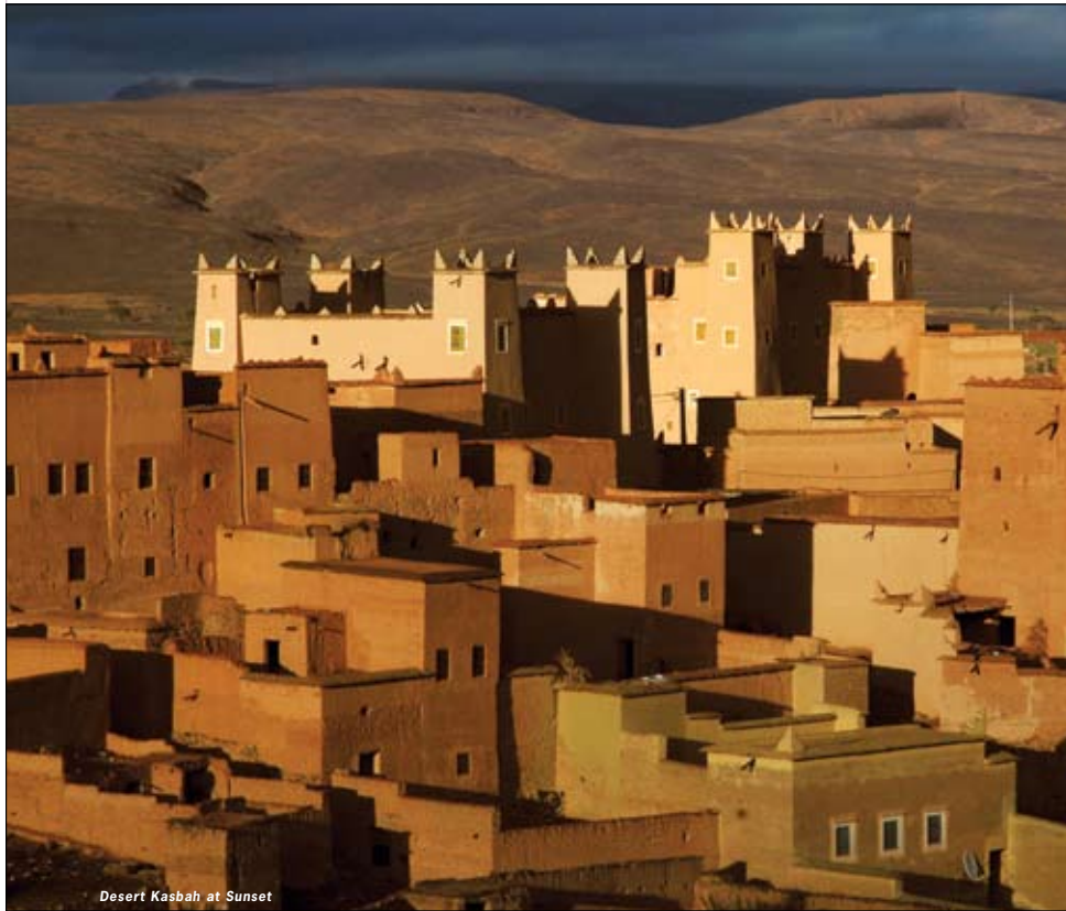
Desert Kasbah at Sunset