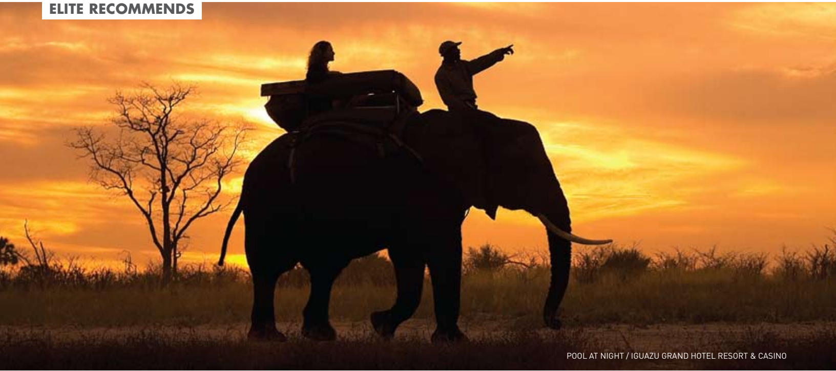
POOL AT NIGHT / IGUAZU GRAND HOTEL RESORT & CASINO