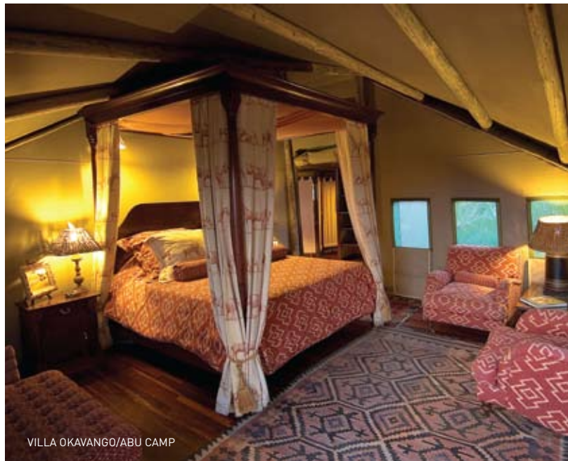
VILLA OKAVANGO/ABU CAMP