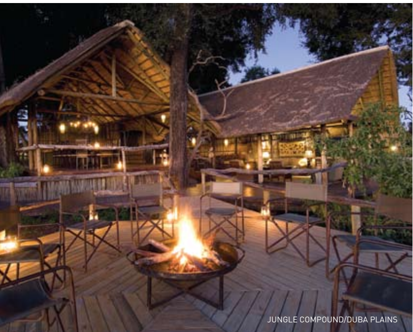
JUNGLE COMPOUND/DUBA PLAINS