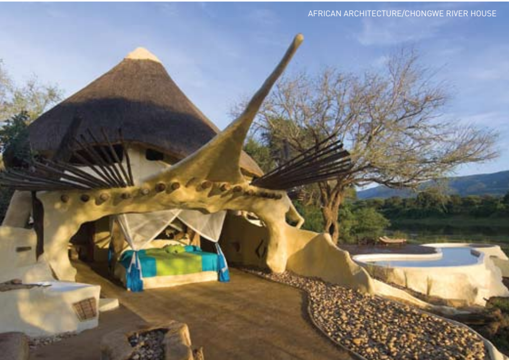
AFRICAN ARCHITECTURE/CHONGWE RIVER HOUSE