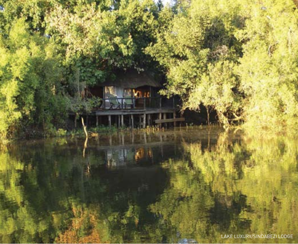
LAKE LUXURY/SINDABEZI LODGE