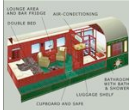
Royal Suite Layout

Deluxe Suites (approx. 118 sq. ft) accommodate two passengers in either twin or double beds and have a lounge area and en-suite bathroom with shower. The very spacious suites offer passengers the opportunity to travel in privacy, comfort and luxury, with fittings and facilities that are of the highest standard. All are equipped with a writing surface and a personal safe for valuables. There is also a bar fridge filled with beverages of the passengers' choice and room service is available 24 hours a day.