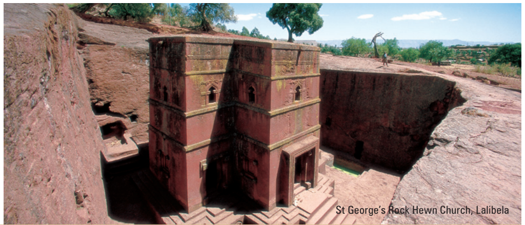
St George's Rock Hewn Church, Lalibela

AFRICA & INDIAN OCEAN | ASIA & PACIFIC | EUROPE | INDIA & BEYOND | LATIN AMERICA & ANTARCTICA | ARABIA & NORTH AFRICA