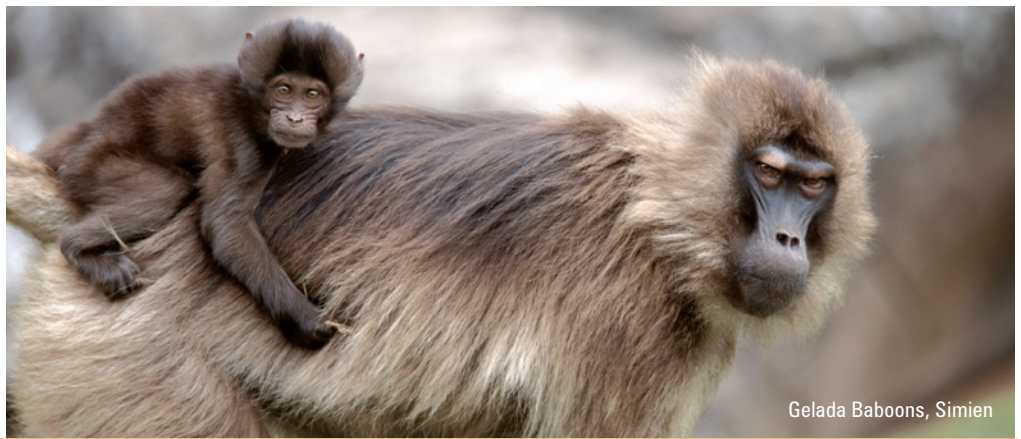
Gelada Baboons, Simien

AFRICA & INDIAN OCEAN | ASIA & PACIFIC | EUROPE | INDIA & BEYOND | LATIN AMERICA & ANTARCTICA | ARABIA & NORTH AFRICA