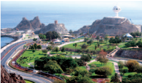
Al Bahri Road, Muscat