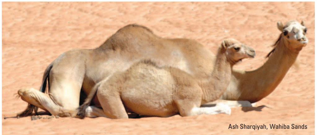
Ash Sharqiyah, Wahiba Sands

AFRICA & INDIAN OCEAN | ASIA & PACIFIC | EUROPE | INDIA & BEYOND | LATIN AMERICA & ANTARCTICA | ARABIA & NORTH AFRICA