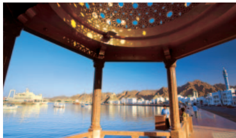
Muttrah Corniche, Muscat

Note: Upon request, your travel consultant can provide an exact price based on your specific dates of travel.