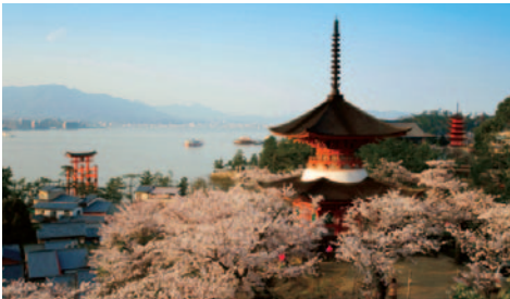
Tahoto Pagoda, Miyajima

After a traditional Japanese lunch, embark on a relaxing boat cruise on Lake Ashi. Ride an aerial cableway up and down at Mt. Komagatake. Hyatt Regency Hakone – 1 night (B, L, D)