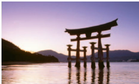
Torii Gate, Miyajima

Sumo Wrestling Tournament: Enjoy a Sumo Wrestling tournament, a popular sport dating back thousands of years. Also visit the Sumo Museum and experience a Dohyo-iri (entering the ring) ceremony at the amphitheater.