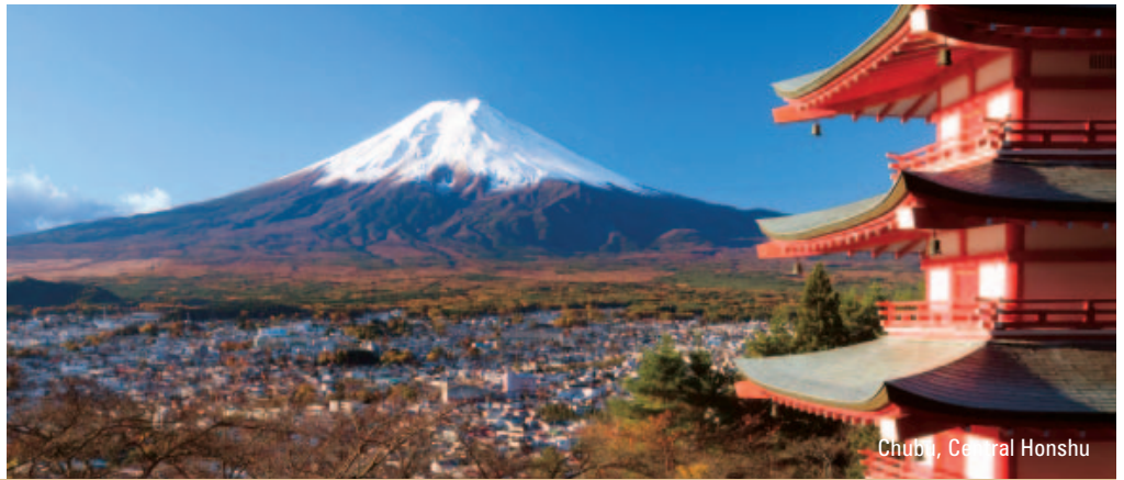
Chubu, Central Honshu

AFRICA & INDIAN OCEAN | ASIA & PACIFIC | EUROPE | INDIA & BEYOND | LATIN AMERICA & ANTARCTICA | ARABIA & NORTH AFRICA