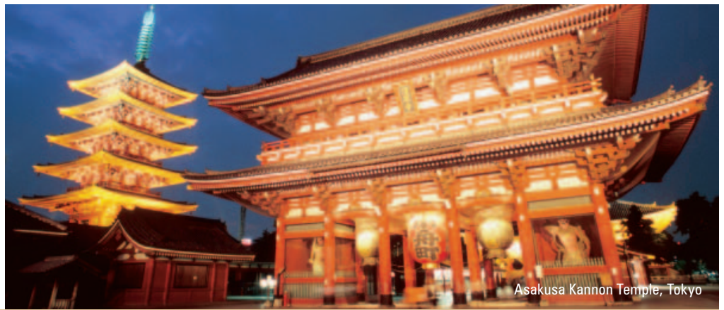
Asakusa Kannon Temple, Tokyo

AFRICA & INDIAN OCEAN | ASIA & PACIFIC | EUROPE | INDIA & BEYOND | LATIN AMERICA & ANTARCTICA | ARABIA & NORTH AFRICA