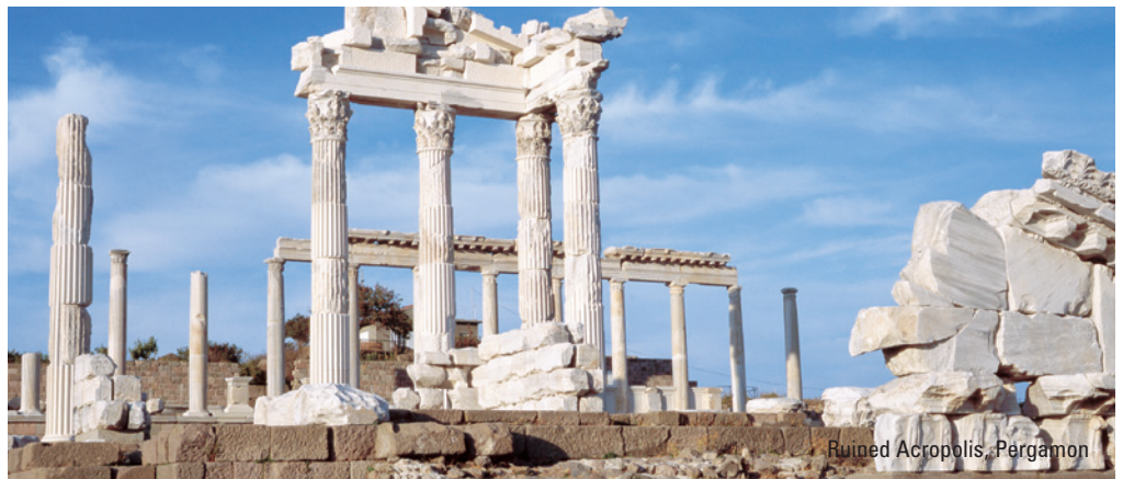
Ruined Acropolis, Pergamon

AFRICA & INDIAN OCEAN | ASIA & PACIFIC | EUROPE | INDIA & BEYOND | LATIN AMERICA & ANTARCTICA | ARABIA & NORTH AFRICA