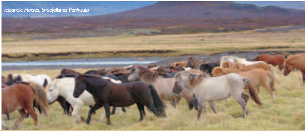
Icelandic Horses, Snaefellsnes Peninsula

AFRICA & INDIAN OCEAN | ASIA & PACIFIC | EUROPE | INDIA & BEYOND | LATIN AMERICA & ANTARCTICA | ARABIA & NORTH AFRICA