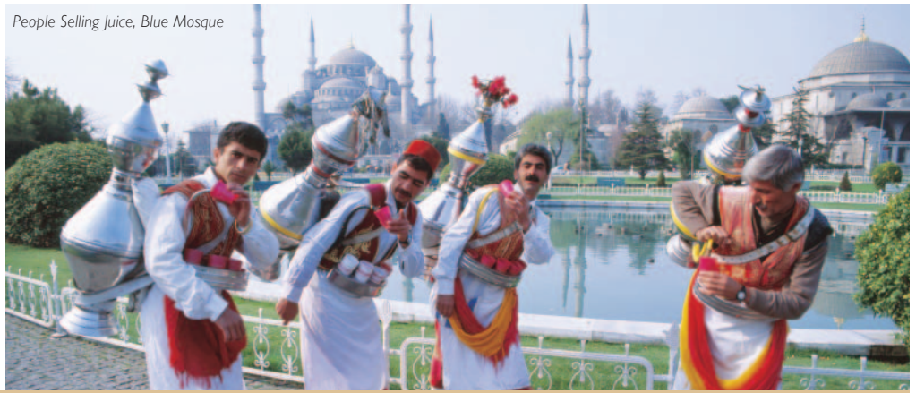
People Selling Juice, Blue Mosque

AFRICA & INDIAN OCEAN | ASIA & PACIFIC | EUROPE | INDIA & BEYOND | LATIN AMERICA & ANTARCTICA | ARABIA & NORTH AFRICA