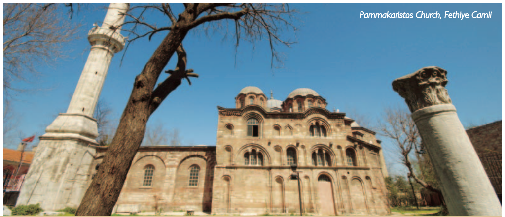
Pammakaristos Church, Fethiye Camii

AFRICA & INDIAN OCEAN | ASIA & PACIFIC | EUROPE | INDIA & BEYOND | LATIN AMERICA & ANTARCTICA | ARABIA & NORTH AFRICA