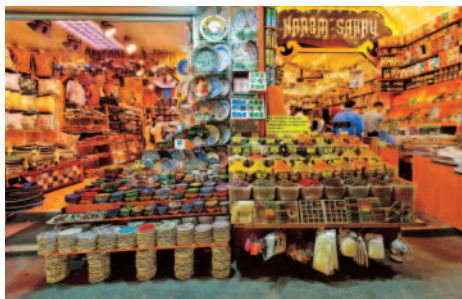
Istanbul's, Grand Bazaar

Option: Dinner cruise on the Bosphorus to see the twinkling lights of the metropolis from the water.