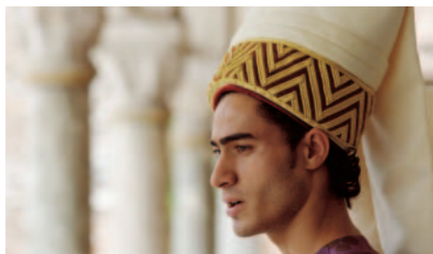
Turkish Guide, Topkapi Palace

FOR MORE DETAILS PLEASE VISIT WWW.COXANDKINGSUSA.COM