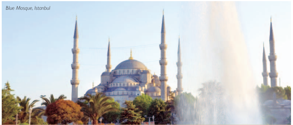
Blue Mosque, Istanbul