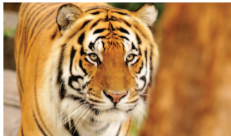
Bengal Tiger, Ranthambore