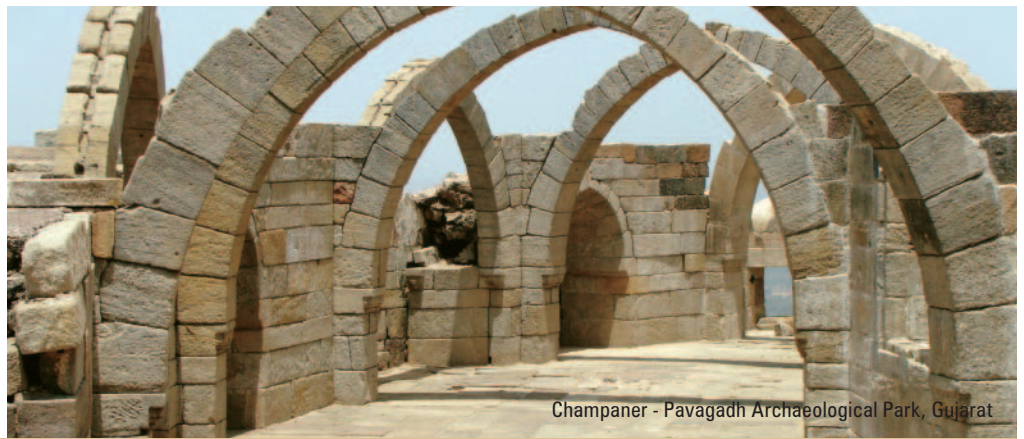
Champaner - Pavagadh Archaeological Park, Gujarat

AFRICA & INDIAN OCEAN | ASIA & PACIFIC | EUROPE | INDIA & BEYOND | LATIN AMERICA & ANTARCTICA | ARABIA & NORTH AFRICA