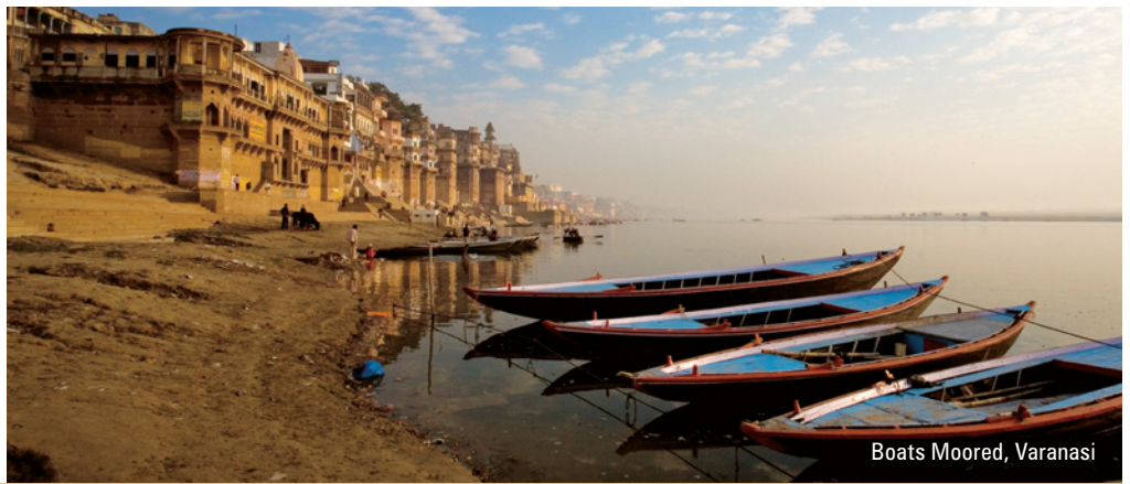
Boats Moored, Varanasi

AFRICA & INDIAN OCEAN | ASIA & PACIFIC | EUROPE | INDIA & BEYOND | LATIN AMERICA & ANTARCTICA | ARABIA & NORTH AFRICA