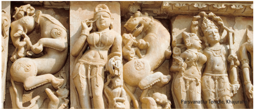
Parsvanatha Temple, Khajuraho

AFRICA & INDIAN OCEAN | ASIA & PACIFIC | EUROPE | INDIA & BEYOND | LATIN AMERICA & ANTARCTICA | ARABIA & NORTH AFRICA