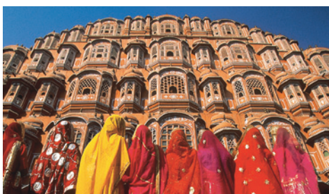
Hawa Mahal, Jaipur

Drive west through the desert to Jodhpur, stopping for lunch en route in Nimaj. Umaid Bhawan Palace (Palace Room) – 2 nights (B, L)