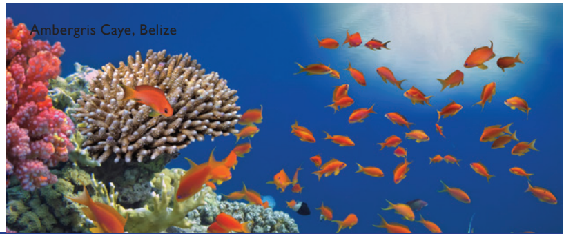
Ambergris Caye, Belize

AFRICA & INDIAN OCEAN | ASIA & PACIFIC | EUROPE | INDIA & BEYOND | LATIN AMERICA & ANTARCTICA | ARABIA & NORTH AFRICA | NORTH AMERICA