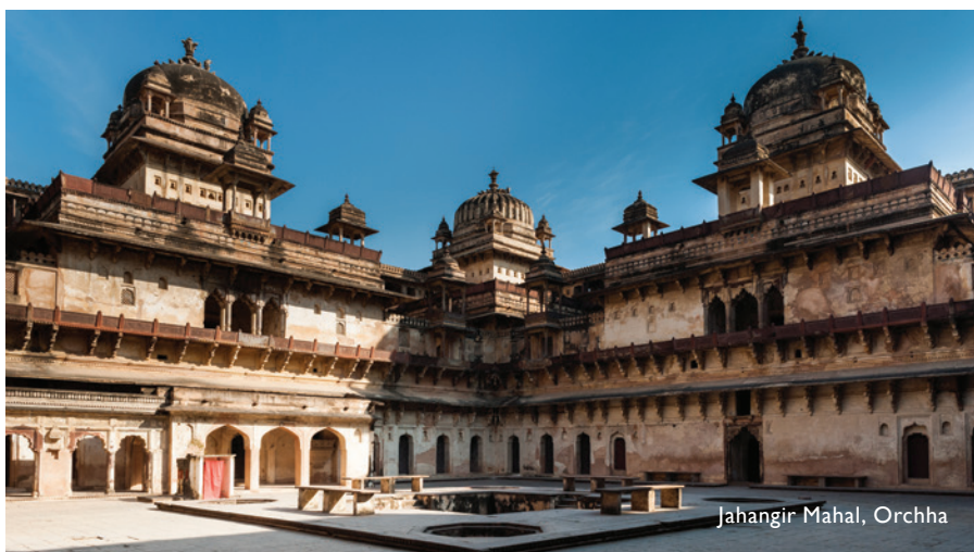
Jahangir Mahal, Orchha